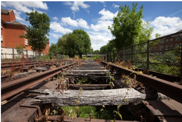
(Swing bridge, 2018)

It's been all hands to the deck over the past few weeks, and as the final painting is completed, we have begun to piece everything back together, placing the longitudinal and lateral timbers on top held together by the tie bars onto which are bolted the metal chairs into which the 95lb bull head rails sit.