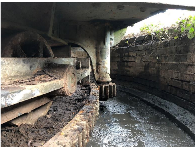
April 2021. The turning mechanism underneath.