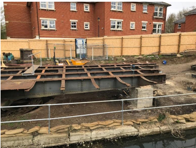
Easter 2021. Jacked up by 60cm.

The eagle-eyed may have spotted that the Swing Bridge now sits 60cm higher than usual. Lifting the Bridge was a difficult but critical task, happening just before Easter to great excitement. It means that the team can now get access to the turning mechanism underneath.