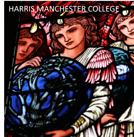
HARRIS MANCHESTER COLLEGE