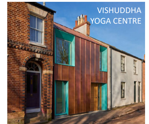
VISHUDDHA YOGA CENTRE

Ground floor is step-free (all facilities including garden space, but excluding main studio).