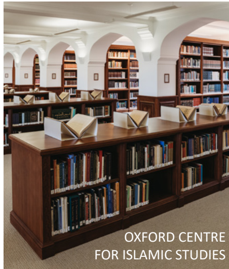
OXFORD CENTRE FOR ISLAMIC STUDIES

Numerous flights of steps, a lift is available if needed. Parking is available to blue badge holders only.