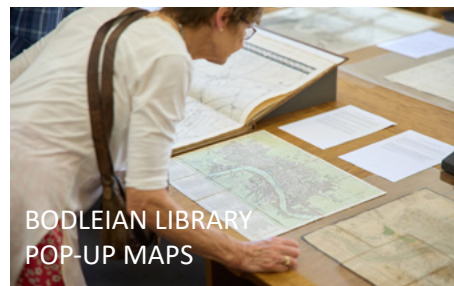
BODLEIAN LIBRARY POP-UP MAPS