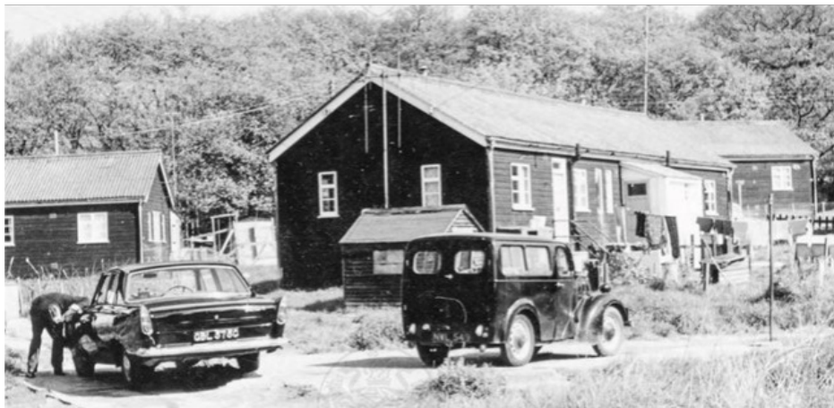
Fourth Street, 1966

After the last residents moved out, Slade Camp was dismantled and the remains of its buildings became overgrown. Local people uncovered them during the Covid pandemic and have been discovering more about their history ever since. Oxford Preservation Trust and Shotover Preservation Society have now been awarded a £49,204 grant by The National Lottery Heritage Fund to share the history of the site. Thanks to National Lottery players the story of Slade Camp will be told by the people who know it best.