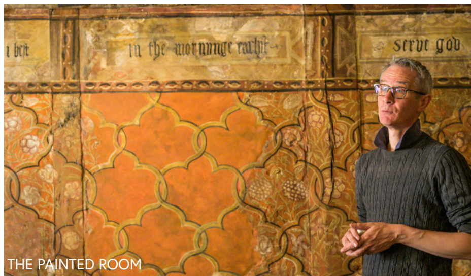
THE PAINTED ROOM

Hidden at the heart of Cornmarket Street, the 14th-century, timber-framed Crown Tavern is complete with oak-panelled walls and remarkably well-preserved Elizabethan wall paintings. Only access via two flights of stairs.