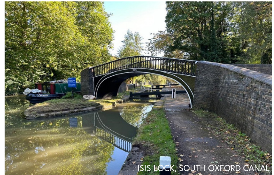
ISIS LOCK, SOUTH OXFORD CANAL

To hear a talk about the history of cinema head to The Ultimate Picture Palace (p27), or explore Oxford's transport history at the MINI Plant Oxford (p7) or the Isis Lock (p7) where the Canal & River Trust will be running a pop-up. Admire stunning contemporary architecture at Oxford Brookes' new Teaching Building (p15) with views across the city, and step inside beautifully restored Yarnton Manor (p19), where you'll find gardens to picnic in, and a brand-new library in the old tithe barn.