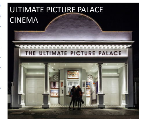
ULTIMATE PICTURE PALACE CINEMA