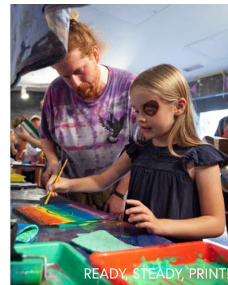
READY, STEADY, PRINT!