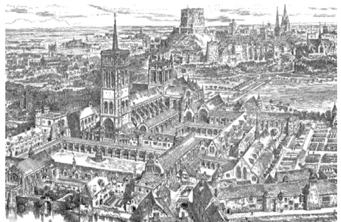
Section from H W Brewer's 1891 drawing of Mediaeval Oxford from the West, showing Osney Abbey in the fore.

Oxford Archaeology is working on a West End Historic Context Study commissioned by the City Council with the support of the Trust and County Council. This Study will provide a historical framework to guide the redevelopment of the West End, and with proposals for Frideswide Square and the Rail Station coming forward, this is timely.