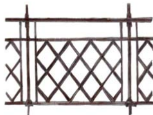
Phase 3 (1880s - 1890s): Walton Manor. Important designs around the Southmoor Road area.