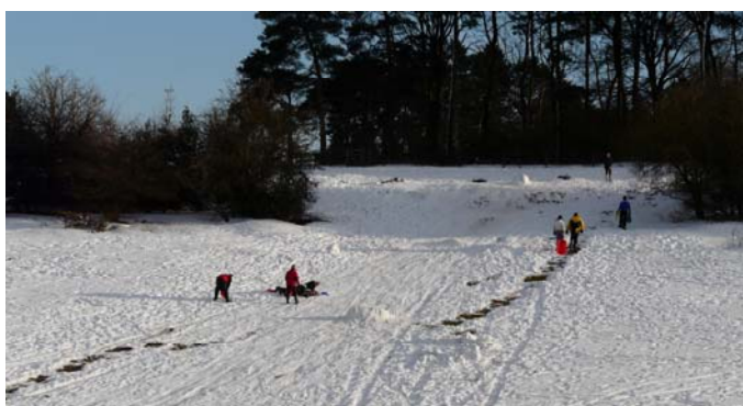
Sledding on the Old Golf Course

The Old Berkeley Golf Course was filled with fun and laughter as children and adults, including the occasional policemen, all enjoyed the snow. We thank the neighbours, friends and wardens for their help in clearing the site after the action.