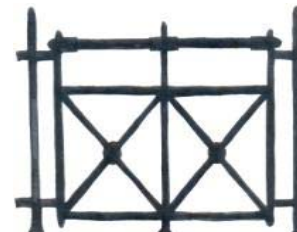
Phase 4 (1890-1900+): Developments outside St John's ownership. Examples: Woodstock, Longworth, Staverton Roads, etc.