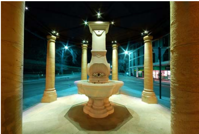
Lighting the Victoria Fountain, Plaque winner 2009