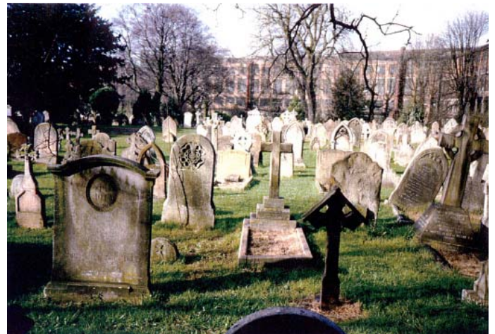
St Sepulchre's in 1992 with the old Lucy's Iron Works

At the Martyr's Memorial , improvements to the paving will begin this Spring.