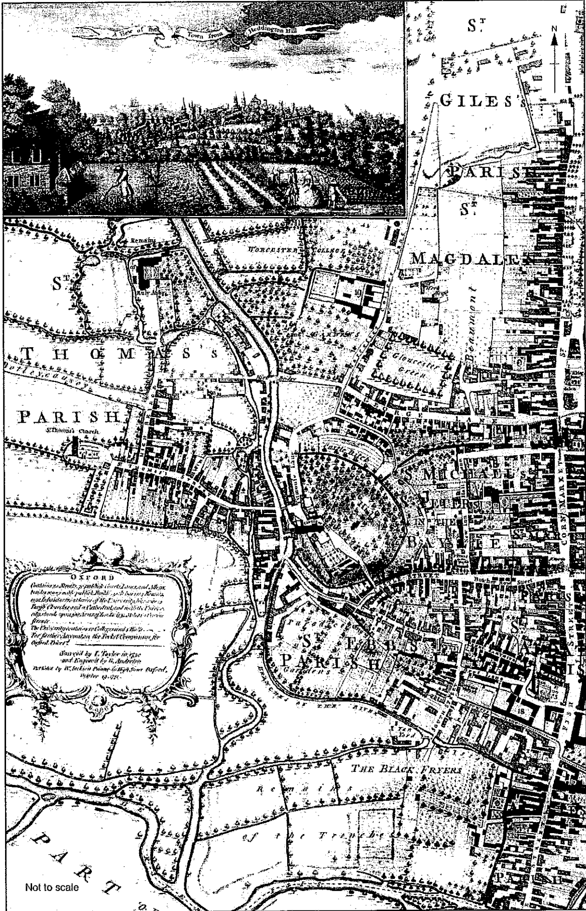
Figure 4: Taylor map 1750