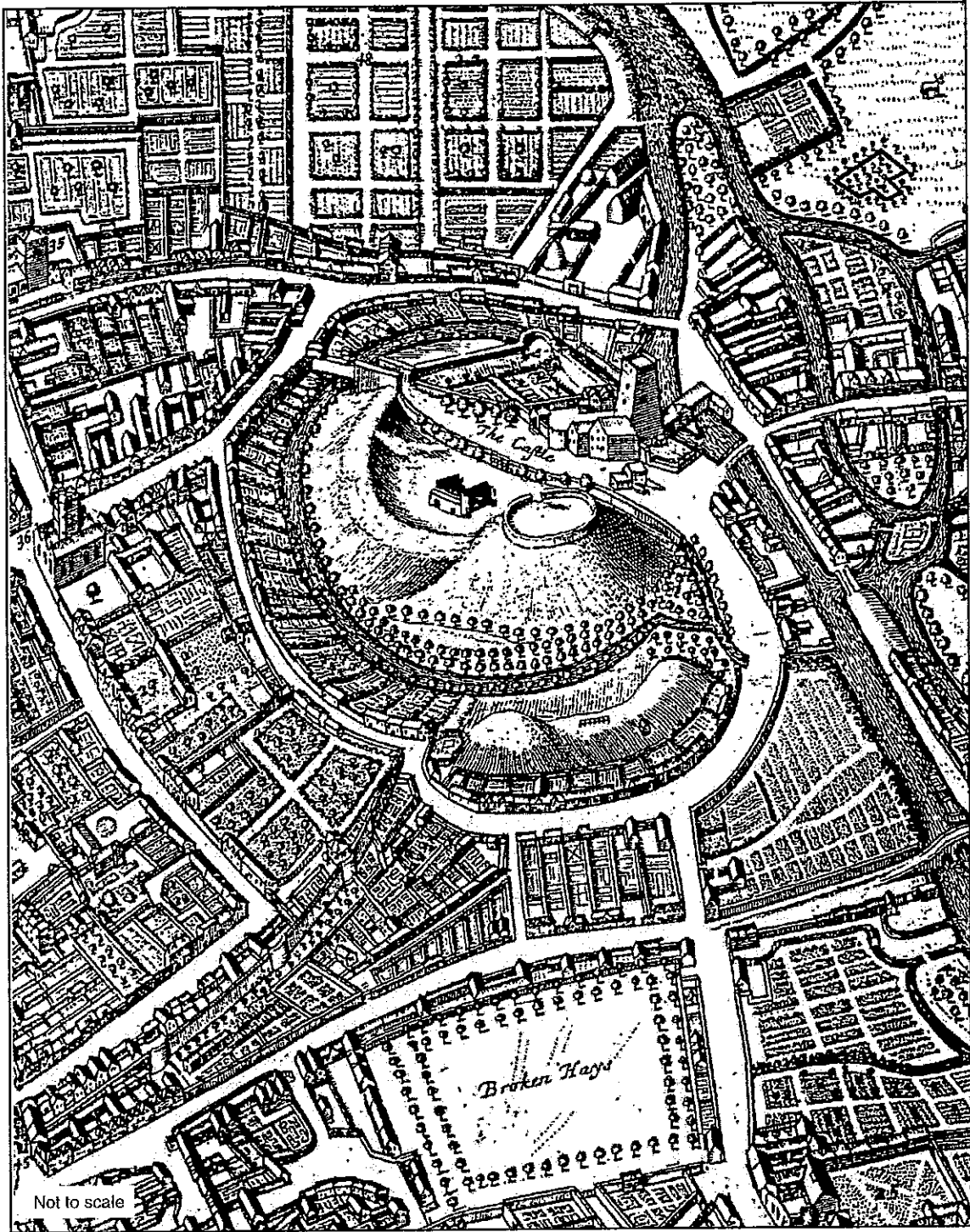
Figure 3: Loggan map, 1675